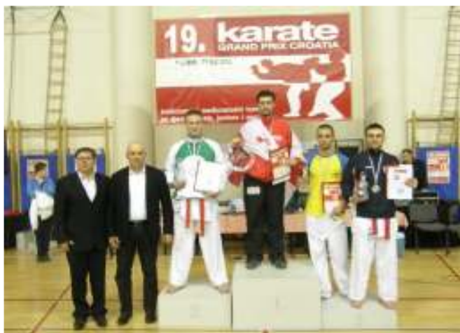
FOTO : GRAND PRIX 2010, 2011, 2012, 2013